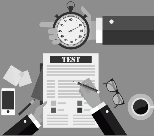
Pen Paper Test: A Relic of the Past